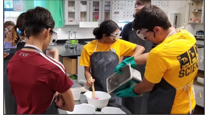
Science National Honor Society members making soap.

The SHS Science National Honor Society Chapter 806 decided to help the environment and to help our community at the same time. We decided to be part of an international initiative that promotes recycling oils that were used mainly in nearby restaurants to cook. We got the used oils from restaurants and donors from Ellison H S and we used the oil to make soap. This soap was later on donated to the Friends In Crisis homeless shelter in Killeen, Texas.