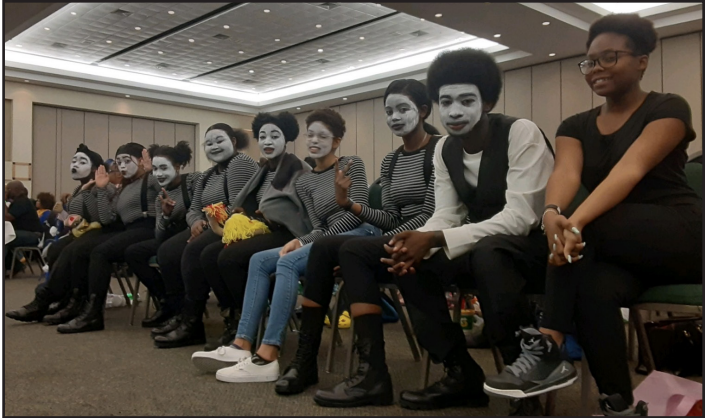
Shoe Phi Steppers won 1st place at the AKA/2020 CTX Community Expo \operatorname{Step} & Talent Show